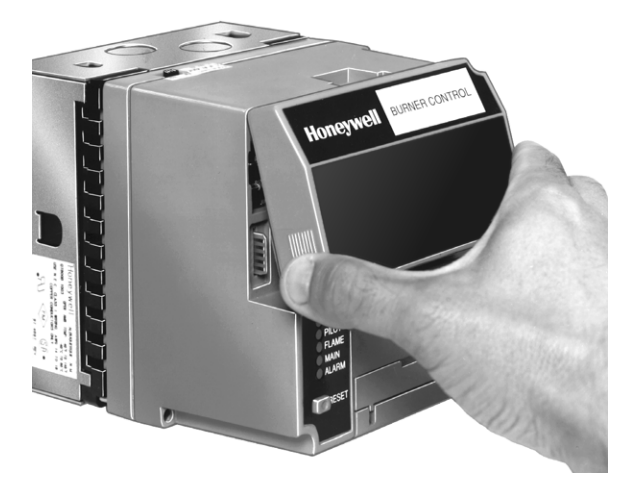
Fig. 2. Mounting Remote Reset Module.

The S7820A Remote Reset Module mounts directly on the Relay Module.